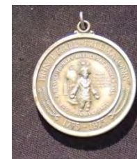
The 1975 medallion