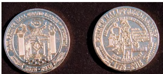
The 2015 medallion