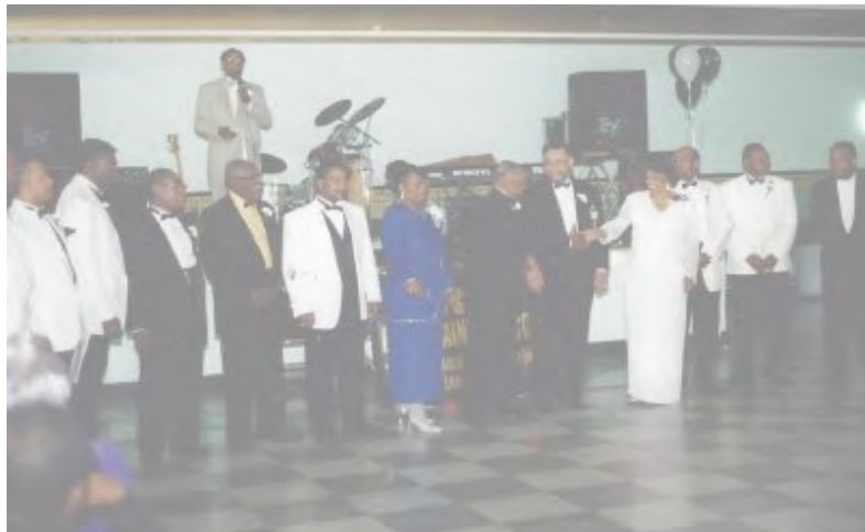
Does the guy in the white evening jacket beside the lady in the blue gown look familiar?