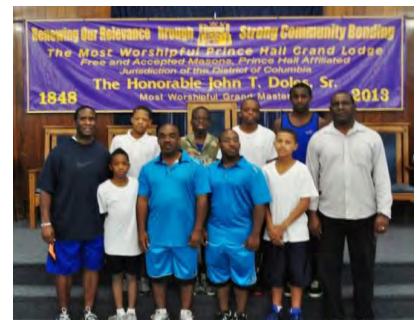
2013 DC Summer Encampment