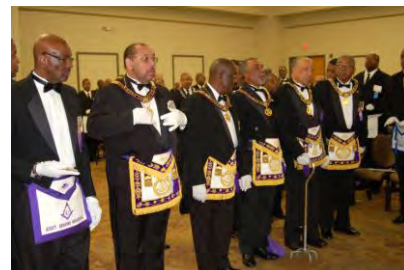
Receiving the Past Grand Masters