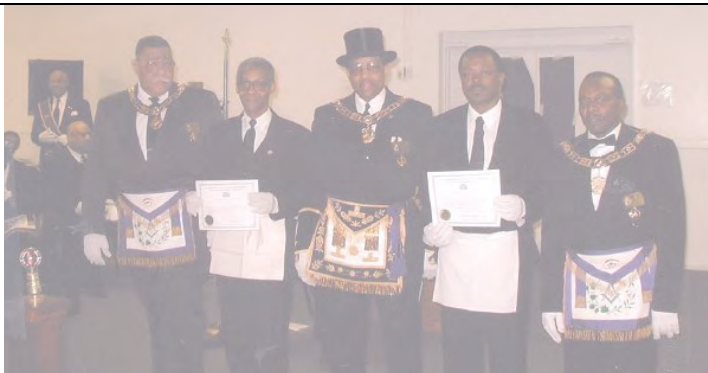
Does the 2003 Grand Lecturer on the far right look familiar?