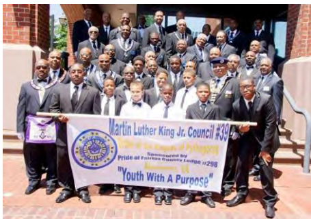
The Council paraded in Alexandria & Fairfax

In the area of community service, we've raised funds for and participated in American Diabetes Association Step Out Walk to Stop Diabetes and helped pack and deliver Thanksgiving baskets. The council had the largest number of attendees at our 2013 summer encampment and attended the District of Columbia's Summer Encampment. Our youth also attended the MWPHGL of Virginia's Founders Day and Grand Lodge Session. We visited the National Museum of the Marine Corps and attended a Washington Wizards basketball game. We also participated in parades in Alexandria and Dale City and attended fifth Sunday's Divine Services with the 31st Masonic District.