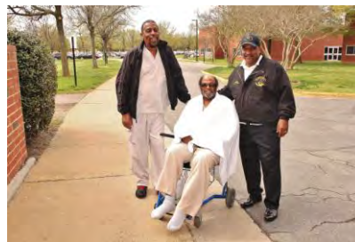
MWGM at McGuire VA Hospital