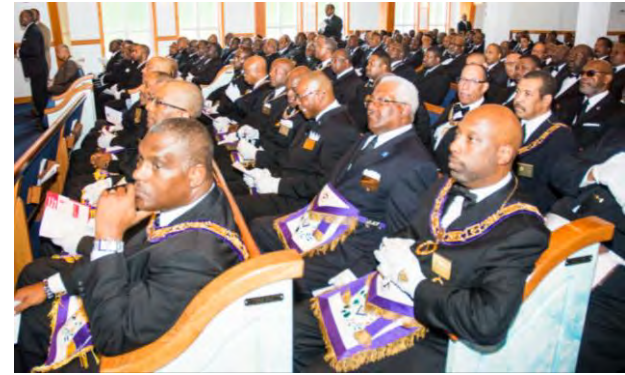
Joint GL St. John the Baptist Day in Tidewater